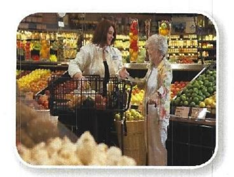
Trained - Bonded Screened - Insured