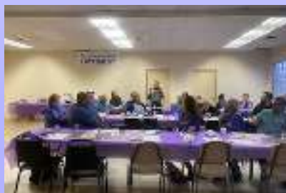
The Rio Communities Optimist Club were great hosts as the food they prepared and the presentation on Optimist International were outstanding!!! Thank you!!! Everyone had a great time and we were blown away with how much our local club does for our community!!!!