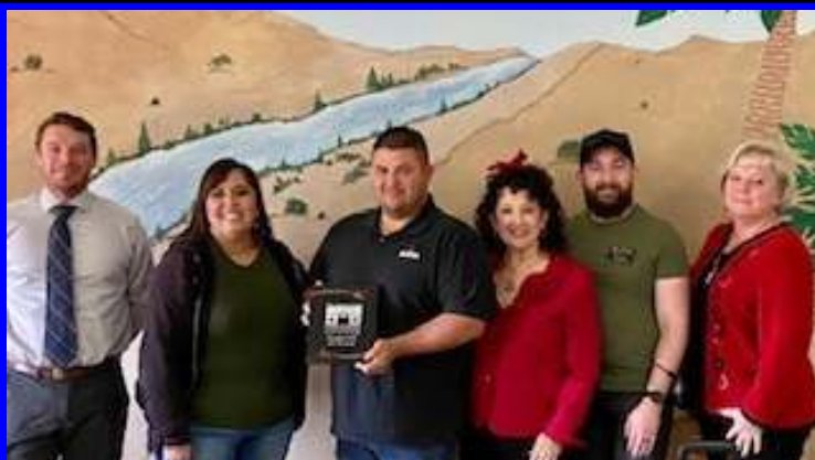
GBCC December Business of the Month Award went to 1st Care of NM

Congratulations to 1st Care of NM as our December Member of the Month! Why choose 1st Care of NM? At 1st Care of New Mexico LLC, we provide a wide range of home health care services to client's all throughout the metro area. Our staff goes above and beyond to make sure you get the best quality care possible, and are committed to providing you with all the resources you need in order to get back on track with your daily assisted activities.