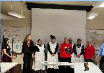
Harvey House representatives

We strive to help make our community better, one person at a time. We are truly grateful to have helped so many people on their journey, and hope we can help many more. Heart & Soul invites you to start living your best life....TODAY! Call 505-312-0040 for an appointment...THIS WEEK!