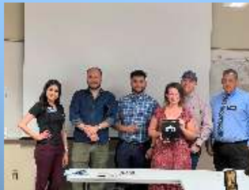
Heart and Soul

A huge thank you to Friends of Whitfield Wildlife Refuge for hosting our May After Hours!! They were able to give the attendees a tour of the refuge and everyone had a wonderful time!!!!